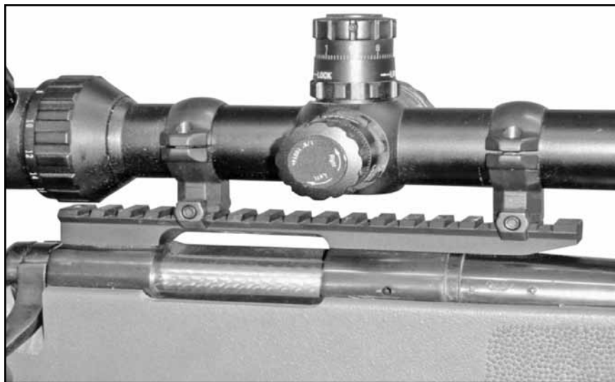
TRS-1 scope mounted on a tactical rifle using Millett Angle-Loc™ rings and Picatinny rail.